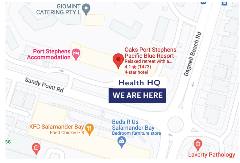
Health HQ Shop 3, 265 Sandy Point Road, Salamander Bay NSW 2317